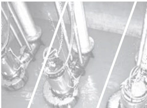
Transport & Treatment