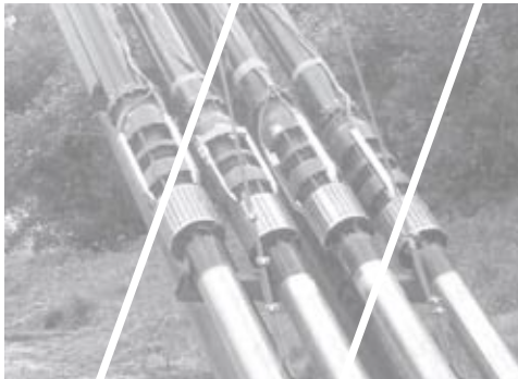
Collection & Distribution

CAPRARI SPA Modena (Italy) • CAPRARI FRANCE SARL Maurepas - Paris (France) • BOMBAS CAPRARI SA Alcalà de Henares Madrid (Spain) • CAPRARI PUMPS (U.K.) LTD Peterborough (United Kingdom) • CAPRARI PUMPEN GMBH Fürth/Bayern (Germany) • CAPRARI PORTUGAL LDA Santarém (Portugal) • CAPRARI PUMPS AUSTRALIA PTY LTD Beverley SA (Australia) • CAPRARI HELLAS SA Thessaloniki (Greece) • CAPRARI TUNISIE SA Ben Arous (Tunisia) • CAPRARI PUMPS (SHANGHAI) CO LTD Shanghai (People's Republic of China) • CAPRARI PUMPS NEW ZEALAND Christchurch (New Zealand)