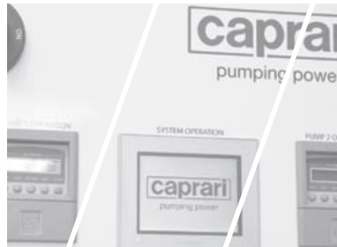
Pump Control Technology