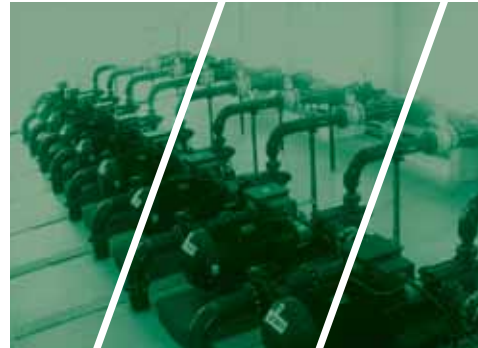
Boosting & Distribution